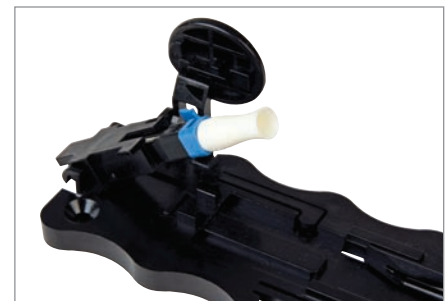
Close up of 3M™ No Polish LC Connector Assembly Tool 250/900 8835-AT