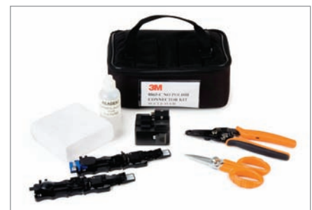
The 3M™ No Polish Connector Kit with Cleaver 8865-C includes all tools necessary for installation.