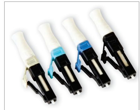
3M™ No Polish LC Connector Family