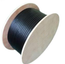
1000* Wood Reel Weight: 19 lbs.

Toll Free: (866) 945-5051 Local: (770) 945-5051 Fax: (770) 945-9582 www.commoditycables.com