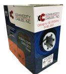
1000' Pull Box Weight: 25 lbs.

Toll Free: (866) 945-5051 Local: (770) 945-5051 Fax: (770) 945-9582 www.commoditycables.com