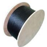
1000' Wood Reel Weight: 42 lbs.