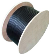
1000' Wood Reel Weight: 35 lbs.

Toll Free: (866) 945-5051 Local: (770) 945-5051 Fax: (770) 945-9582 www.commoditycables.com