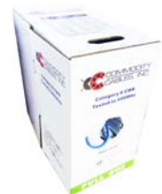
1000' Pull Box Weight: 29 lbs.