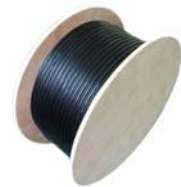
1000' Wood Reel Weight: 49 lbs.