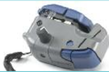
Pretium Cleaver | Photo LAN805