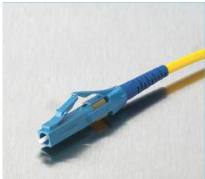
UniCam Pretium-Performance LC Single-Mode Connector | Photo LAN625