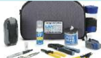
UniCam Pretium Tool Kit | Photo LAN769