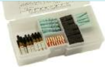
UniCam Connector Organizer Pack (multimode SC connectors shown) | Photo LAN809