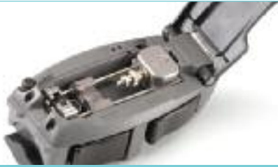
UniCam® Pretium® Installation Tool | Photo LAN770