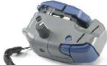
Pretium Cleaver | Photo LAN805