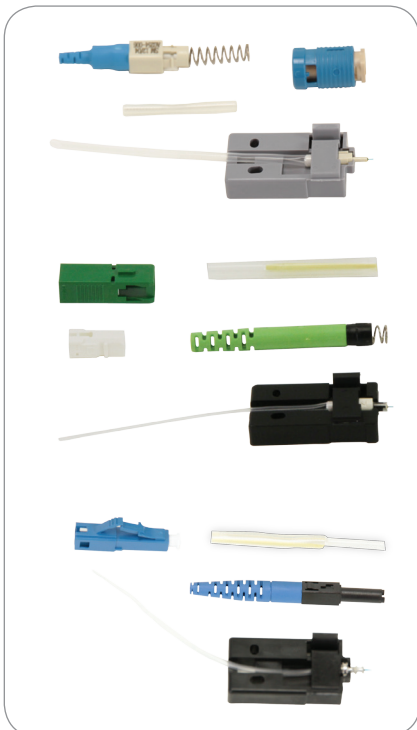
FuseConnect Kits—ST (blue), SC (green), LC (blue)