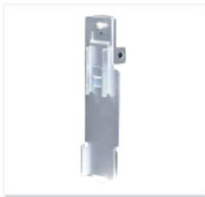
DIN Rail Mounting Bracket