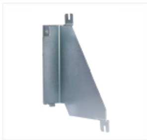
Panel Mounting Bracket

The industrial KCD-300 media converter series provides industrial strength Ethernet copper-to-fiber media conversion, allowing for 10Base-T-100Base-FX or 100Base-TX-100Base-FX over multi-mode or optional single-mode fiber optical media.